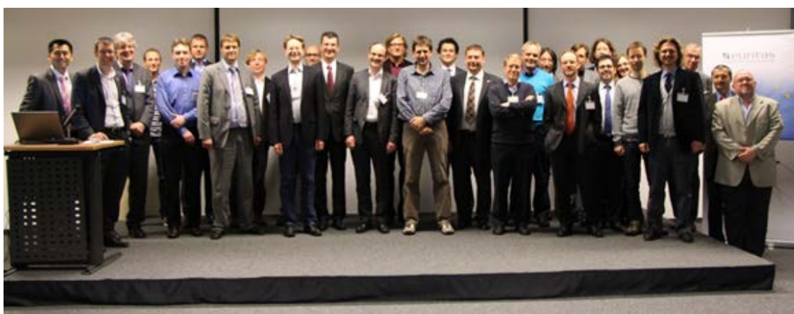
The SECCRIT consortium and the guests from the user and advisory board workshop in Vienna.

Request for U/P & additional information can be sent to: info@seccrit.eu